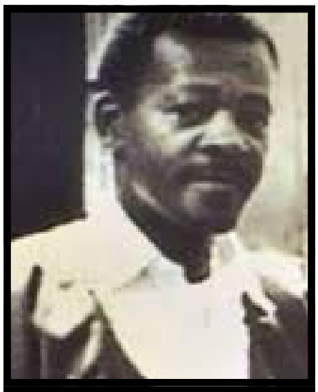
"Allah had told them, if they ever needed him all they had to do was come together."